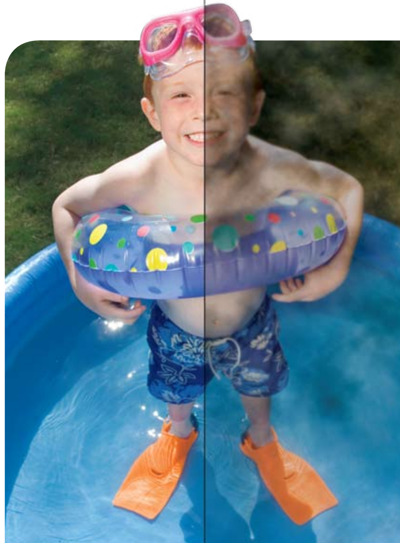
Vision with Cataracts